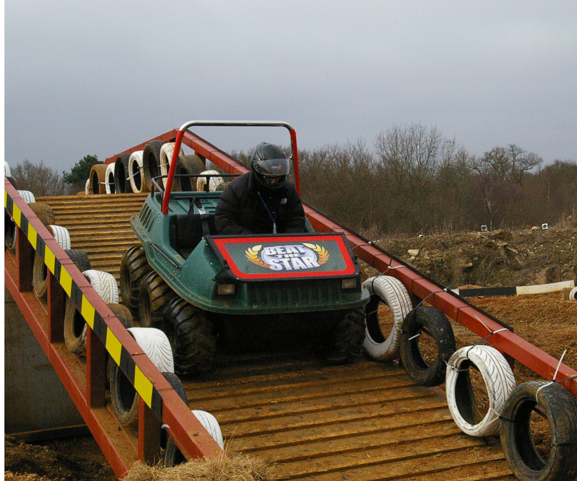
TV & Film - Paul O'Grady Show, One Show, Beat the Star, The Whole 19 Yards, Text Santa