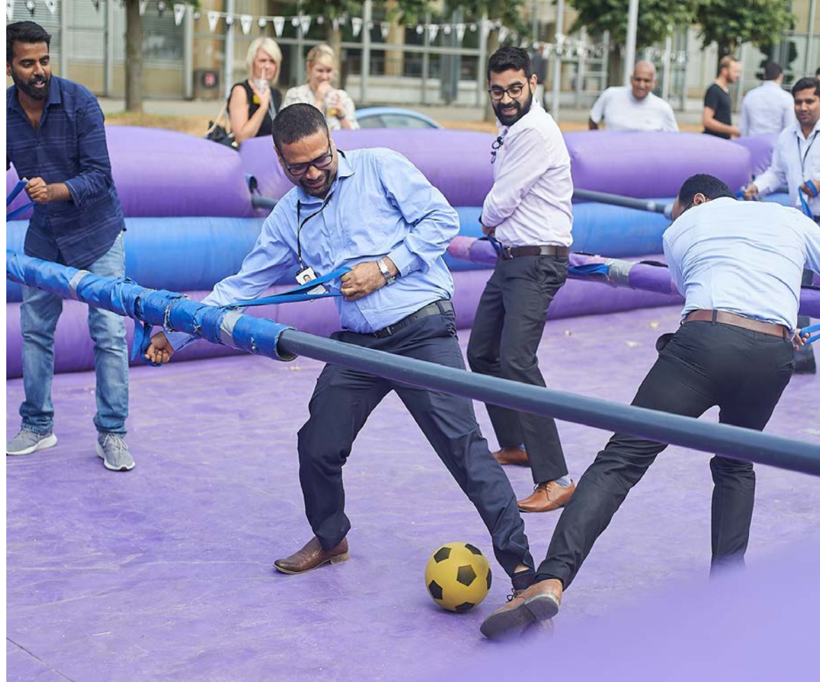
Outdoor - Last Man Standing, Motorised Beer Kegs, Flintstones, Segway, Air Rifle Scrabble, Crossbow, Axe Throwing, Archery, Human Table Football