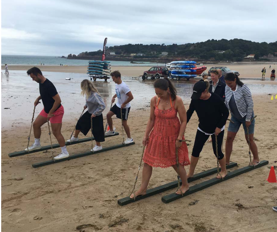
Abroad - Jersey, Malta, Barcelona, Gibraltar