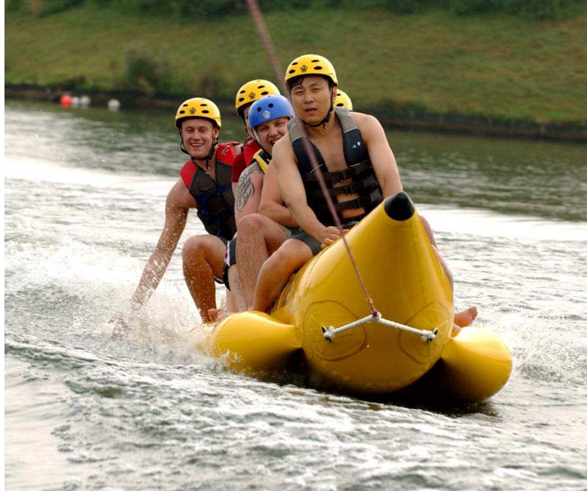
Reading Lake - Wakeboard, Water Ski, Raft Building, Build-a-Boat, Ringo, Paddleboard, Banana Boat