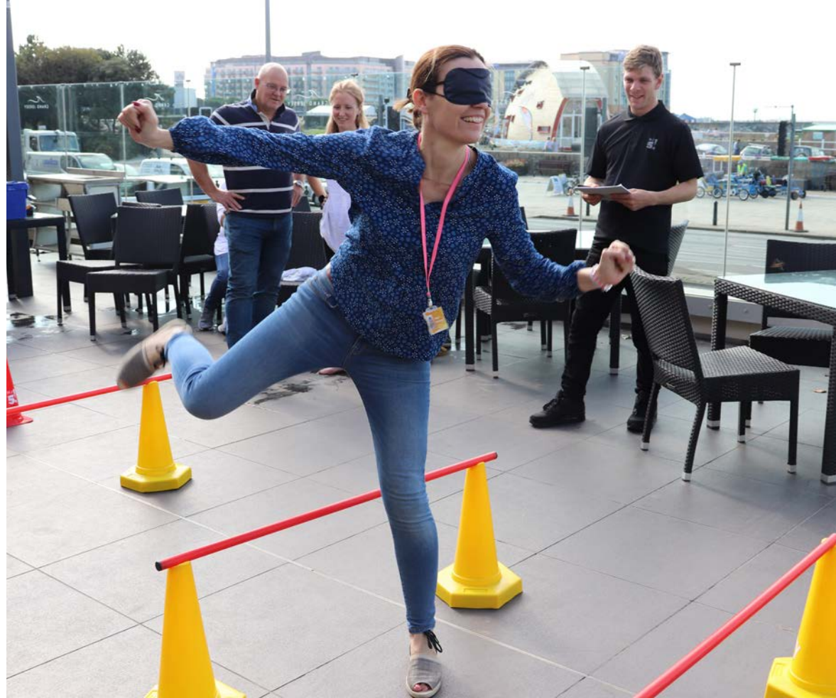
Qube Games & Challenges - Qube Games: Cylinder, Walk in the Dark, SpeedCube, Stack, Interchange, Agility. Challenges: Escape, Rescue Barbie, Marble Run